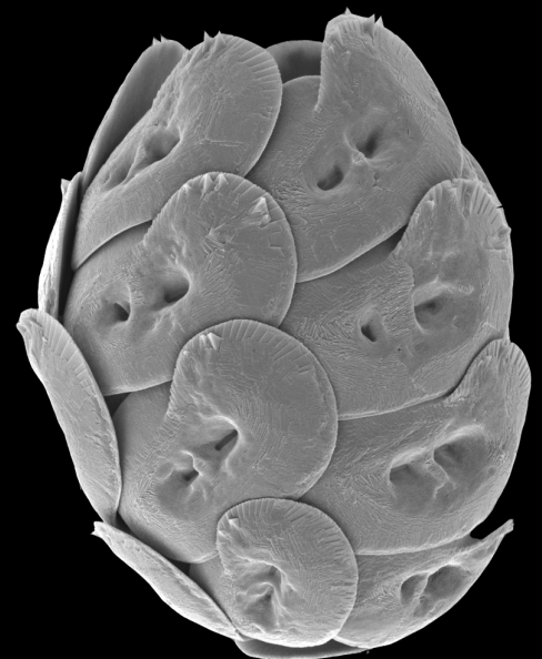
SEM image of a modern Helicosphaera carteri .